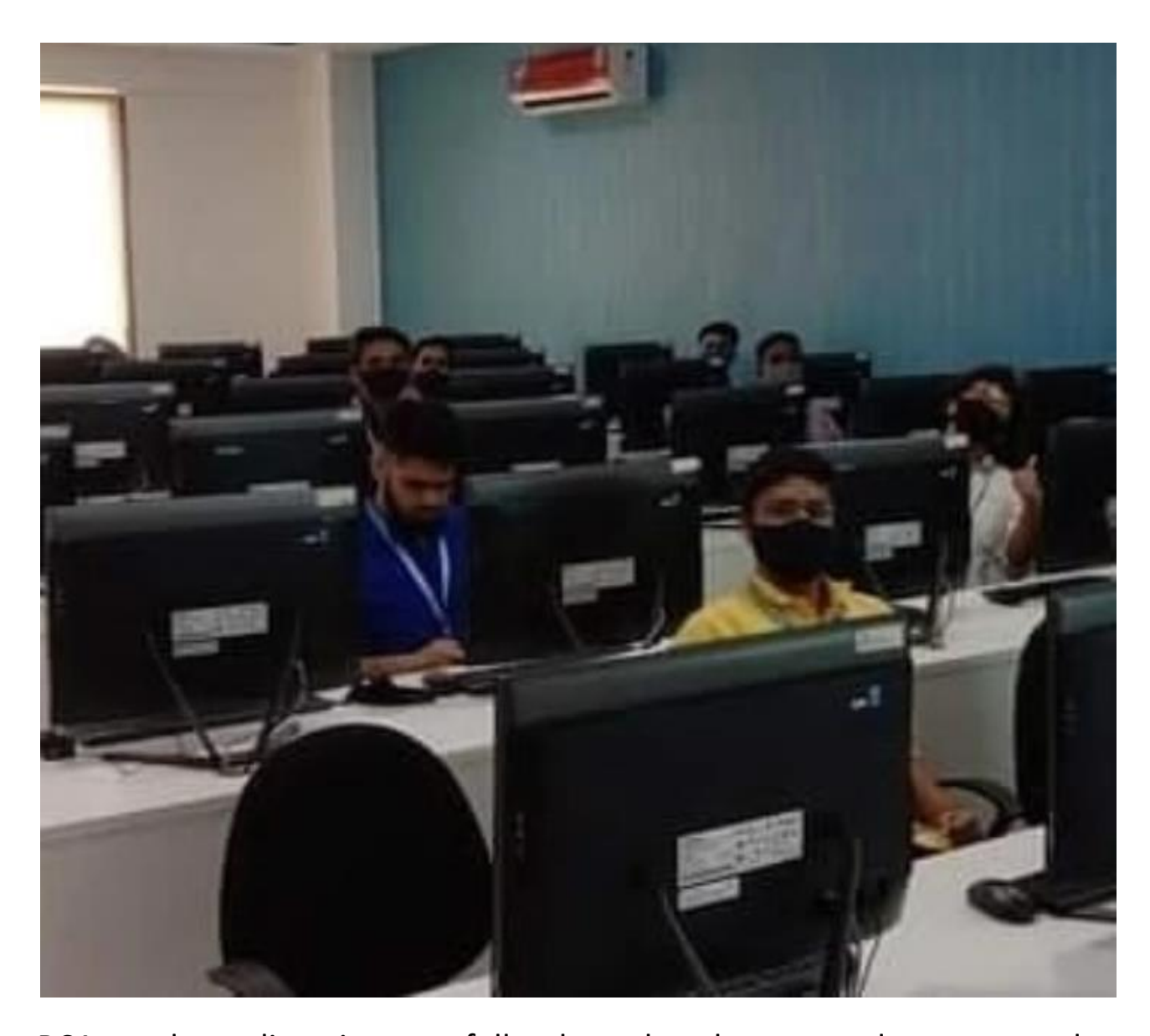
BCA students listening carefully through robust sound system and applying the commands on their screen.