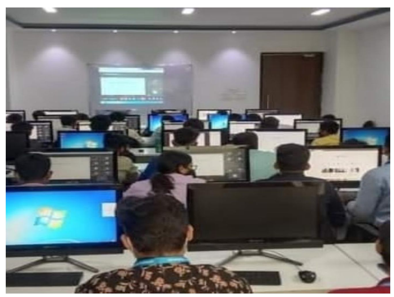
2 Days python training program in online mode for AIIT